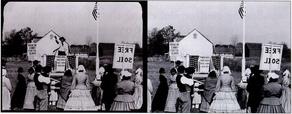
“Pseudo Event, Free Soil,” 1987–1988, from American History Reinvented . (L): Albumen print, 16 × 20 in.; (R): RC print, 8 × 10 in.