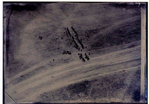
(L) “The Battle of Chickamauga,” 1990–1991, and (R) “Chickamauga Double Line-up,” 1990, from American History Reinvented . Tintypes, 5 × 7 in.