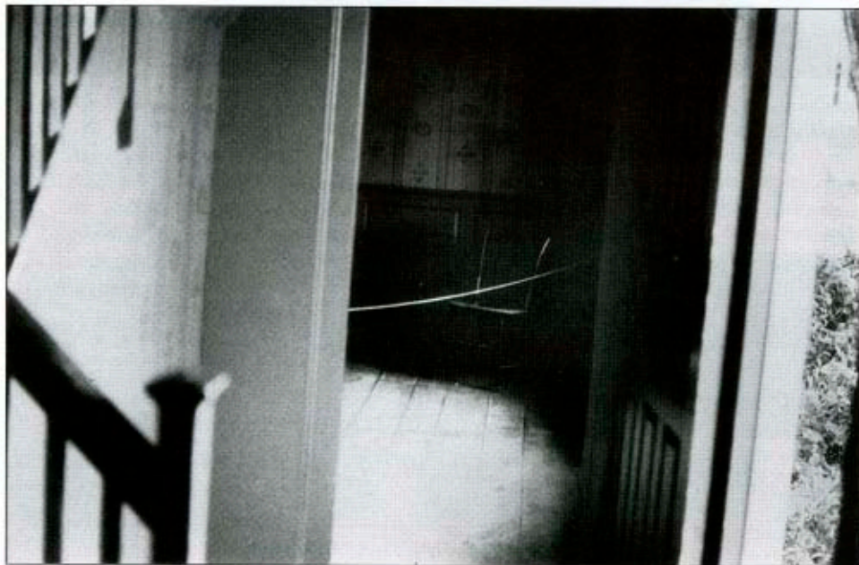
"Recoding American History, Roping off History," 1986, from American History Reinvented. Albumen print, 8 × 10 in.