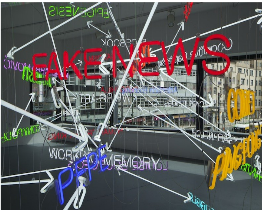
Warren Neidich: 'Pizzagate', 2017

The Beuys comparison is a thought-provoking one that doesn't end there. 'Das Kapital Raum' was put together for the 1980 Venice Biennale , but Beuys had already used many of its components (including 50 blackboards with chalk markings and diagrams) in previous artistic projects. The installation included many other objects: a grand piano, a spear, plugged in tape recorders and video projectors, and a microphone. English translations of the title range from Capital 'Room' to 'Region' or 'Space', and the ambiguity is telling. Is this a room made to house Capital, or do the objects themselves render it a 'Capital Space'? I prefer the second option, which causes us to look closely at the disparate-seeming objects and ask what makes them Capital. They are, of course, all stores of value (some of them, the grand piano for instance, are worth a lot). But more compellingly, they are stores of creative potential.